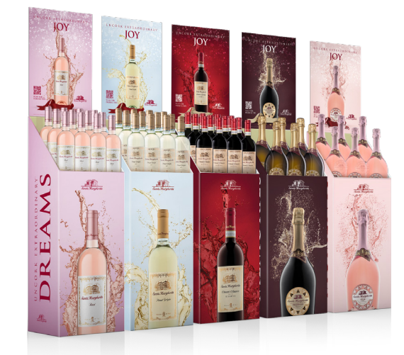
Double Sided Case Cards - 13.53" W x 25.44" H Design to be used throughout T3. Each QR code leads the consumer to varietal landing page.