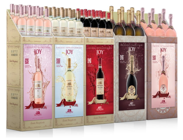
Case Glorifiers - 12" W x 23.5" H Design to be used throughout T3. Each QR code leads the consumer to varietal landing page.