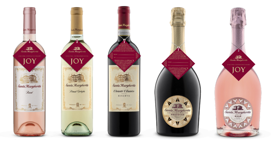
Holiday Gift Tag - 2.2981" W x 2.2981" H Design to be used throughout T3. Gift Tag to be merchandised at the point of purchase.