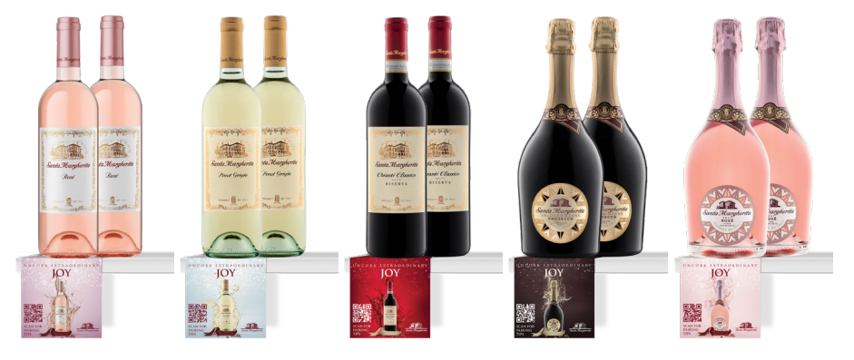
Shelf Talkers - 3" W x 3.75" H Design to be used throughout T3. Each QR code leads the consumer to varietal landing page.

Find our print-ready files at SantaMargheritaUSA.com/trade-resources/santa-margherita/