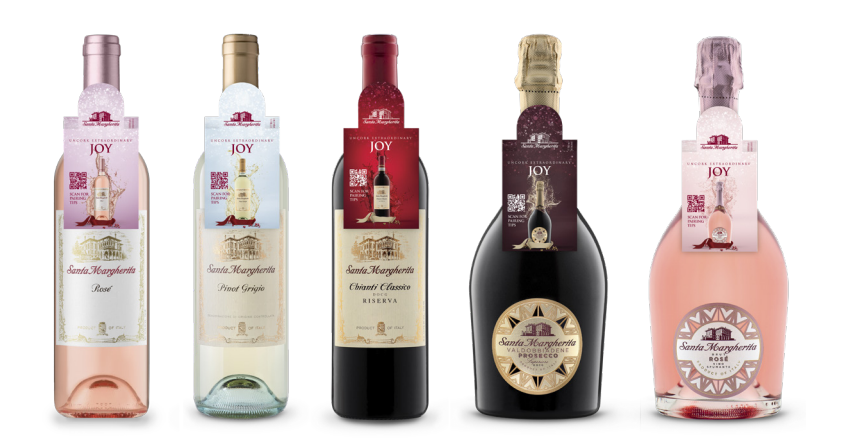
Neckers- 2.25" W x 4.5" H Design to be used throughout T3. Each QR code leads the consumer to varietal landing page.

Find our print-ready files at SantaMargheritaUSA.com/trade-resources/santa-margherita/